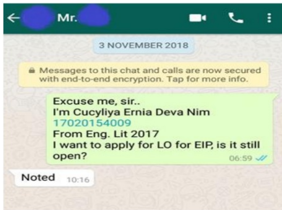
Figure 2. Flouting the maxim of manner

Figure 2 shows a conversation of lecturer 2 and his student. The answer from lecturer 2 does not relate to the question which the student asked about. That means he floutes the maxim of manner. The purpose is to direct the meaning that the student could be accepted in that activity without any further to ask about. The way he broke the maxim is in a way of flouting the maxim of manner. It shows that instead of texting and explaining briefly he just mentioned 'noted' that did not give clear information whether the student's application is accepted or not in that students activity program. The answer he gave also shows that it needed an inference to be understood that the meaning is 'yes, you are accepted', that is why it is considered as the particularized conversational implicature.