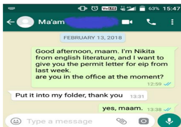
Figure 1. Flouting the maxim of relevance

This conversation occurred between a student and one of the lecturers of English Literature when the student had to submit a permit letter after being absent for EIP program. According to the context, lecturer 1 (see Figure 1) is conducting particularized conversational implicature in the ending by flouting relevance maxim. It needs a certain background knowledge to figure out what was the lecturer was talking about and the utterance triggers an inference process in which the addressee looks for the likeliest that is relevant in the context that obtained. What the lecturer said through her utterance did not contain what she meant, but only what she implied. The action to “ put ” the letter in her folder ordinarily did not convey anything about the asked question; whether she was present in the office or not. Instead, the implicature in this case depends on the context as well as the utterance itself; that the student was asked to put the letter directly into her folder meaning that the student would not be able to meet her, thus