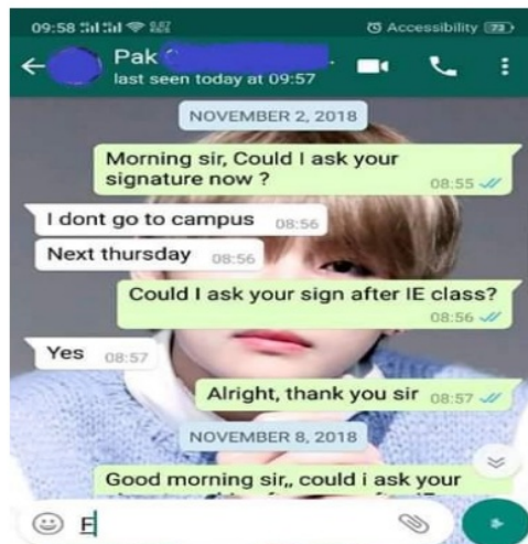
Figure 5. Flouting the maxim of quantity

In Figure 4, lecturer 4 shows that there is a student who is late in collecting ESC books, she apologizes for the delay in collecting the book by explaining the reasons for the delay. However, the lecturer answers as if indeed the book must be collected on time. In this case the lecturer flouted the maxim of relation or relevance because the relevance of the answer needs to be concluded based on information from the initial context. The way of breaking maxim uses flouting because in the chat the lecturer makes a word where her student need to understand the final intention from the lecturer. In the sentence 'Every Esc activity should report on a week right away' written by the lecturer is a generalized conversation implicature which is a sentence that is still general. General here is an expression that all people can understand the implications of that sentence.