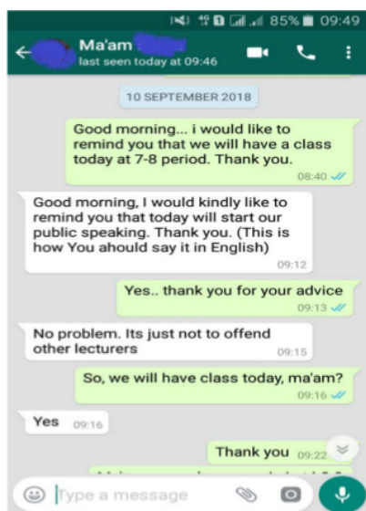
18 Figure 6. Flouting the maxim of manner

The above picture is the condition from lecturer 6 (see Figure 6) with her student asking information about the class. The respond from the lecturer is considered as flouting the maxim of manner, because in this way, the lecturer did not give a clear and brief respond that she will attend the lecture or not in that day. She replied the student by giving an example of polite reminder toward a lecturer. It could also be seen that the student asked her again by saying 'So, we will have class today, ma'am?' to make sure that she would attend the class or not. This revision from the lecturer also means that this does not need an inference to be understood