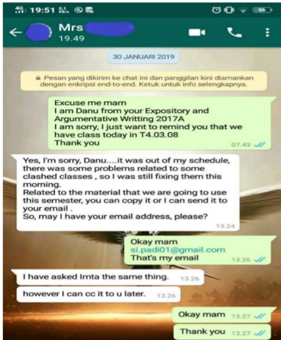
Figure 3. Flouting the maxim of quantity